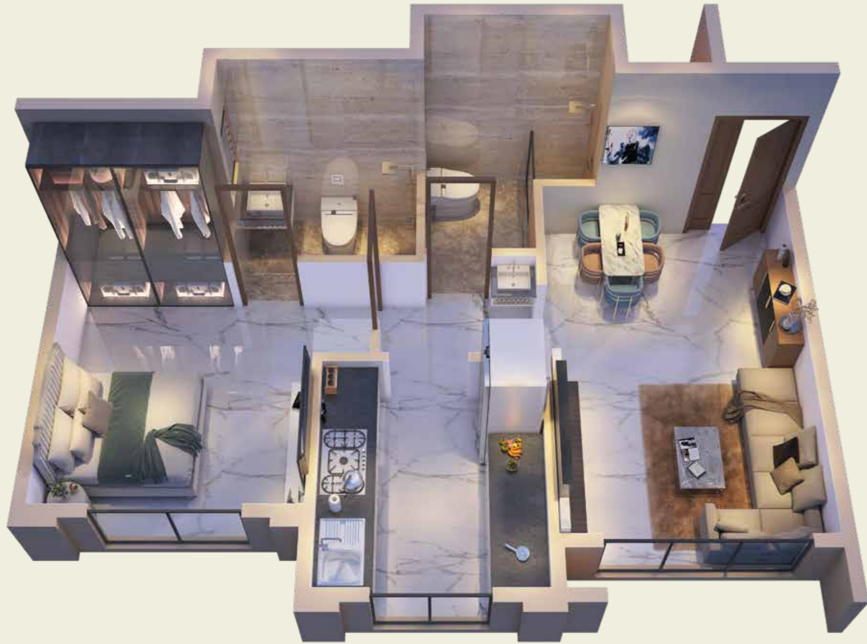
1 BHK UNIT PLAN